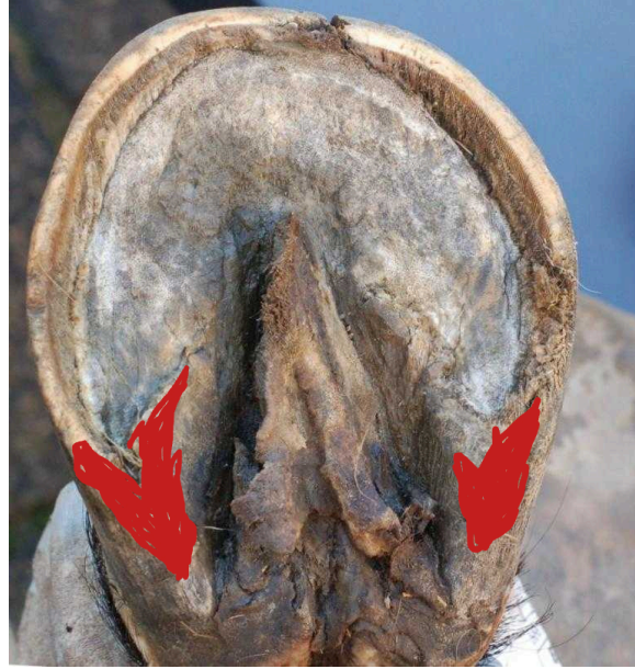
Where his heels should be trimmed to.